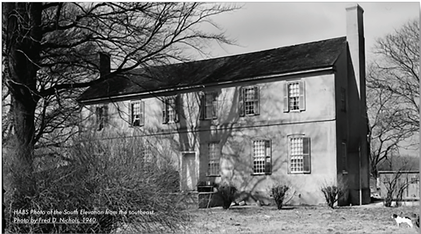
HABS Photo of the South Elevation from the southeast.