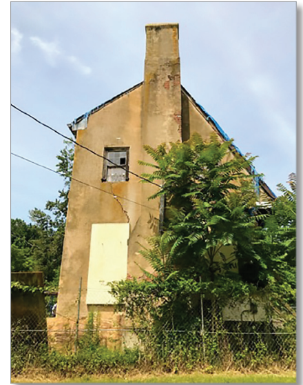
Melwood Park east elevation showing the odd roofline which resulted from raising the roof on the south elevation (but not the north) c.1767.

Hopefully more information will be uncovered in the coming years, as the south wall is deconstructed and rebuilt, and more research can be completed. Until then, we are grateful for the careful excavation and documentation of the archeological resources there. ■