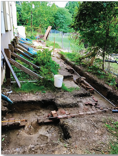
Melwood Park 2016–2017 Ottery Group archeological excavations. Taken near the southwest corner of the building, looking east. Photo by Daniel Tana, 2017.