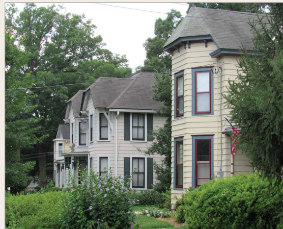
Some residences in Gaithersburg's Chestnut/Meem Historic District

The goal of the report titled Fiscal Impact of Local Designation on Gaithersburg's Historic Districts , completed in March 2017, was to determine the quantitative financial effects of designation on the City of Gaithersburg's local historic districts. Economic values for the single-family homes within the city's two residential historic districts—Brookes, Russell, and Walker and Chestnut/Meem—were studied and compared to those within Realty Park, Observatory Heights, and Deer Park, three residential neighborhoods within the city similar to the historic districts in terms of period of construction, architectural styles, and building and lot sizes.