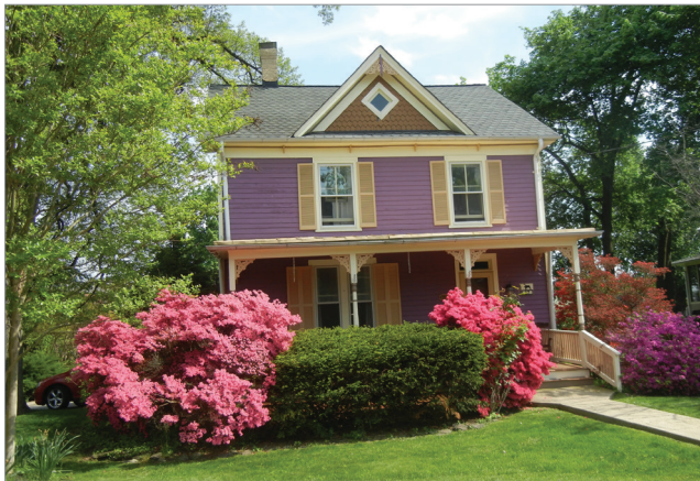
A residence in Gaithersburg's Brookes, Russell, and Walker Historic District

economic value indicators in the Brooks, Russell, and Walker and Chestnut/Meem historic districts often performed comparably with—and sometimes better than—the indicators compiled for the three non-designated neighborhoods. Moreover, the study contended that historic designation can be more financially advantageous to property owners long term because of the availability