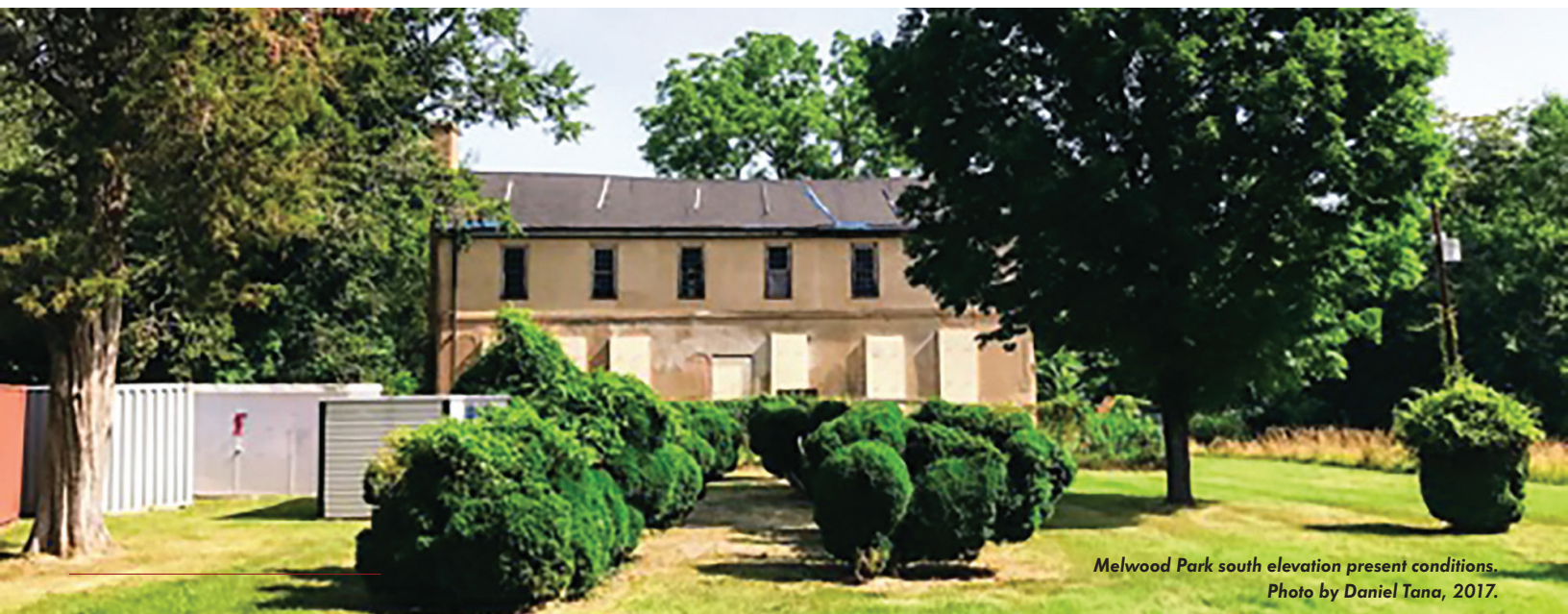
Melwood Park south elevation present conditions. Photo by Daniel Tana, 2017.