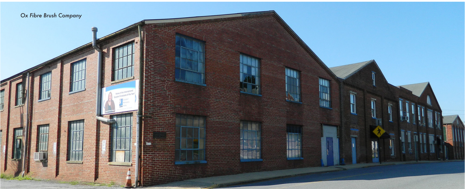
Ox Fibre Brush Company

The HPC concurred with this recommendation. This will be the first of several phases of designation applications unrelated to the demolition review ordinance. Staff will complete research and meet with property owners this summer and hearings will begin in September 2015.