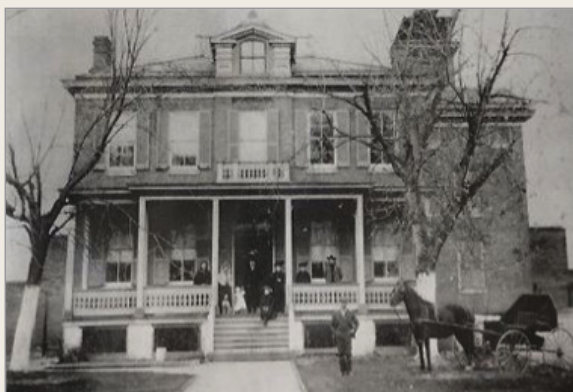
Historic Image of the Former Frederick County Jail

were executed within the jail yard, with the last execution occurring in November 1922.