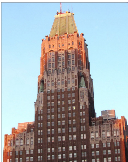
Baltimore Trust Building

At the time of its completion in December of 1929, the Baltimore Trust Company Building at 10 Light Street marked the arrival of the tallest skyscraper on the East Coast south of New York City. The 509-foot-tall building, at 34 stories, remained the tallest building in Baltimore until 1973. The steel-framed building was Baltimore's first Art Deco skyscraper and was twice the height of any existing structure in the city when it was constructed.