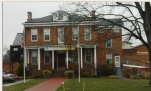
Current Image of the Former Frederick County Jail

Today, the Rescue Mission uses the property and it is the hope of local preservationists that this unique building can be preserved while serving its new purpose.