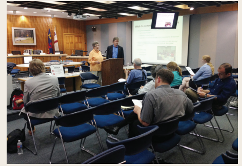
Connecting with your Community Workshop in Montgomery County