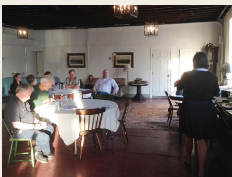
Design Review Workshop in Port Deposit

We are looking for professionals who are as committed to preservation of Maryland's historic resources as we are. If you are interested in being listed in the Directory, please complete the application on our website to join MAHDC as a Business Associate ($30 per year). We ask that you read and agree to abide by our Directory Policies.