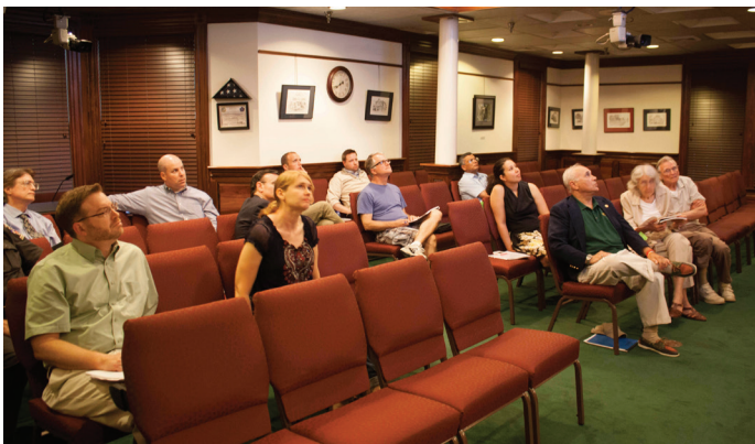
Design Review Workshop in Gaithersburg

MAHDC, a tax-exempt 501(c)(3) organization, is supported by donations from supporters like you. Your gifts are fully tax-deductible and enable us to enrich and expand our training program offerings as well as provide important support and advocacy for commissioners and preservationists who need our help. Donations of any level are welcome on the donate page of our website.