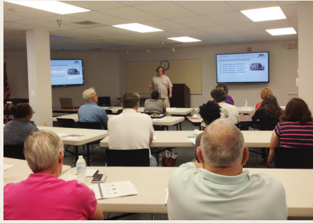
Law and Procedures Workshop in Calvert County