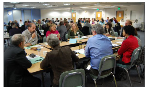
Stakeholders participate in early discussions regarding the PreserveMaryland planning process.

Finally, you can share your support for the plan through social media.... Visit the MHT website for a more detailed description of the planning process and many of the key issues which will be covered by the plan at http://mht.maryland.gov/plan.html or "like" us on Facebook at PreserveMaryland.